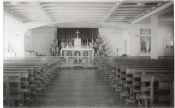
Mass was celebrated in the basement of the school