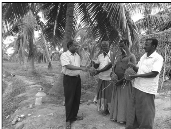
Coconut plants given to the people.