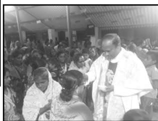
Anointing with oil