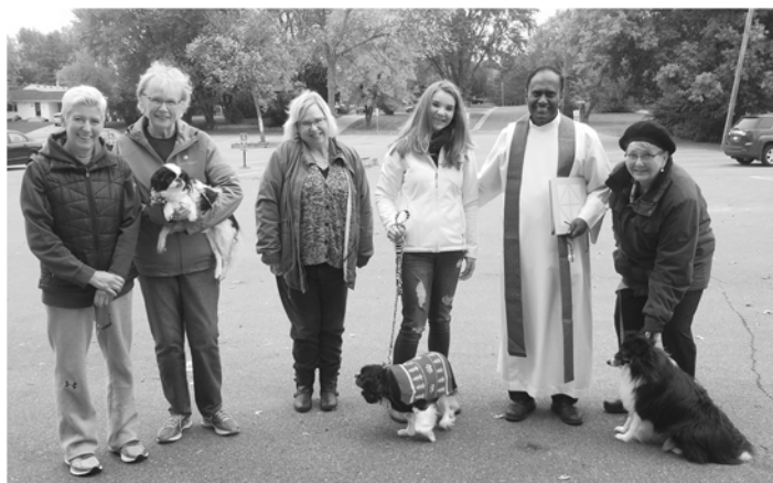
Sunday, October 7 The Blessing of Animals