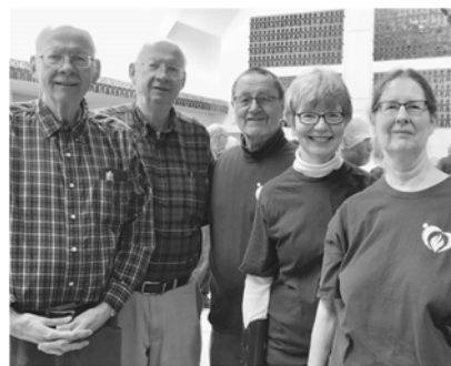
Parishioners packed food for Feed My Starving Children.

PRISM requests basic items this month: Peanut butter, Rice, Instant Oatmeal, Sugar, Macaroni (Note: these items spell PRISM)